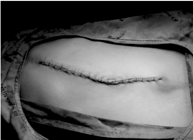
Figure 5 Laparotomy wound

invasion. Pathologic report of the umbilicus also revealed metastatic poorly differentiated adenocarcinoma, involving full thickness of skin and peritoneum, presence of lymphovascular invasion and free all surgical margins.