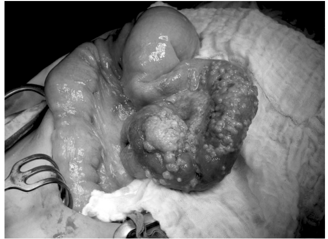
Figure 3 Tumor mass at ileum with partial obstruction