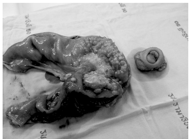
Figure 4 Specimens of jejunal segment and umbilicus